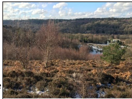
Punch Bowl from East Rim