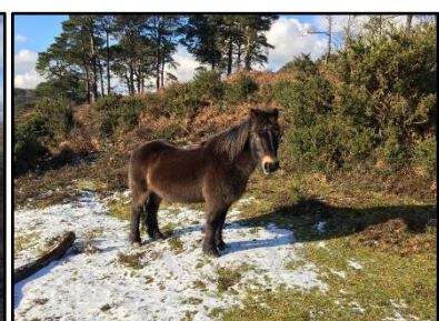
Dartmoor pony in the Punch Bowl