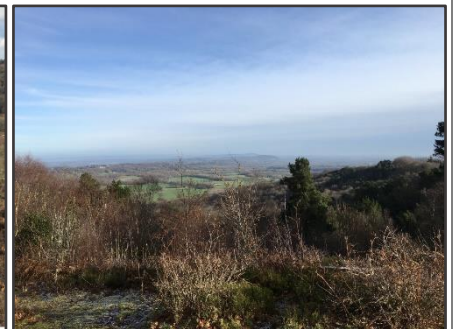
View from Gibbett Hill